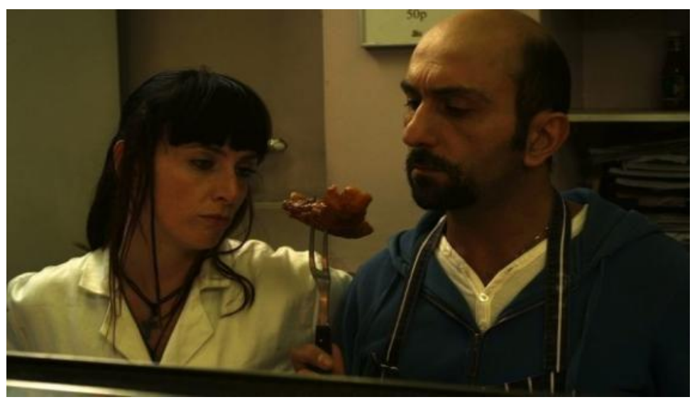
ELIAS DEMETRIOU, Fish n' Chips (2011) – Cypriot-Greek-British co-production