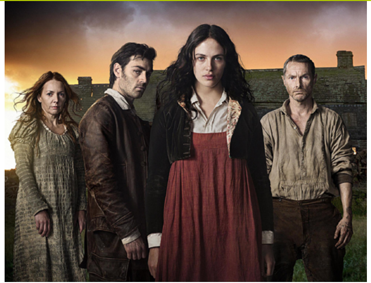
Jamaica Inn , 2014 – Production company: Origin Pictures