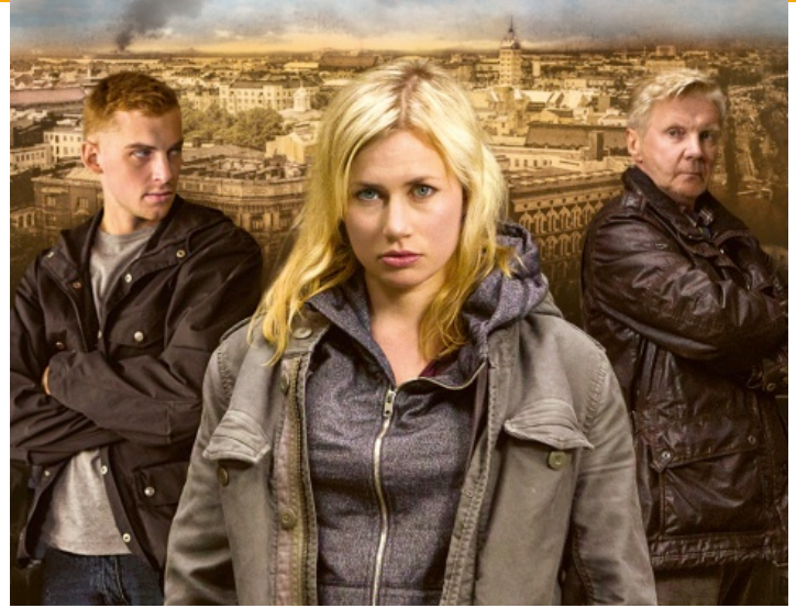
Tellus , 2014 – Production Company: YLE, Finnish Broadcasting Company