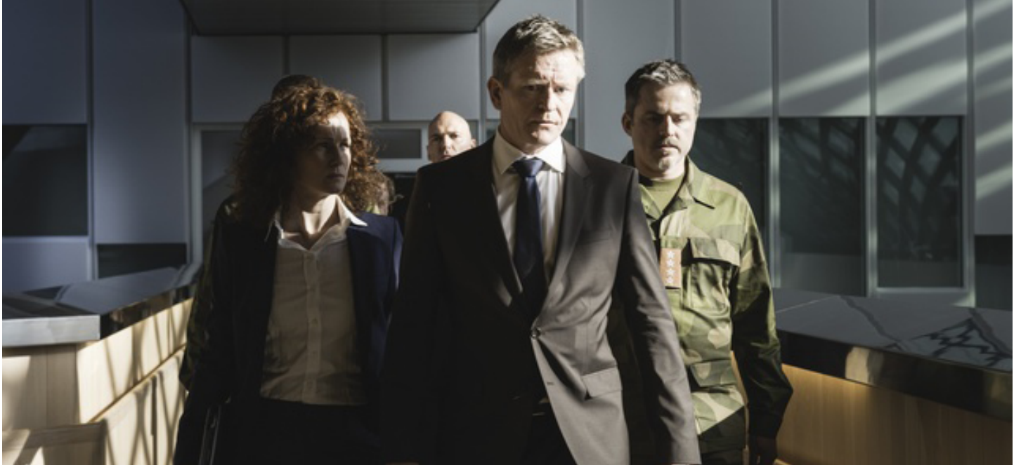
Occupied (Yellow Bird Norway AS) has received funding from the TV-programming scheme of the MEDIA programme.