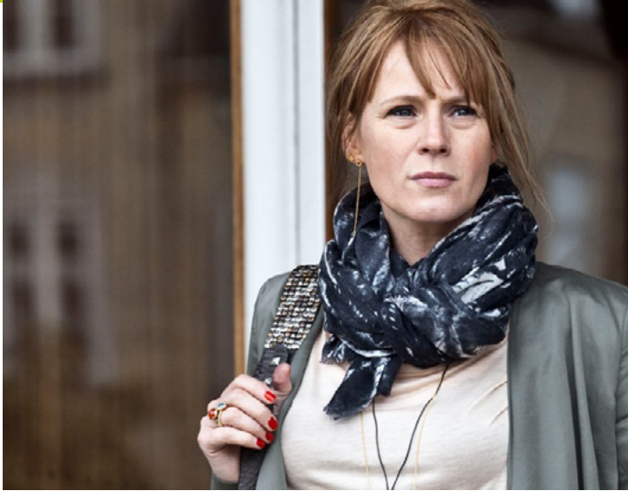
Dicte, 2013. TV2