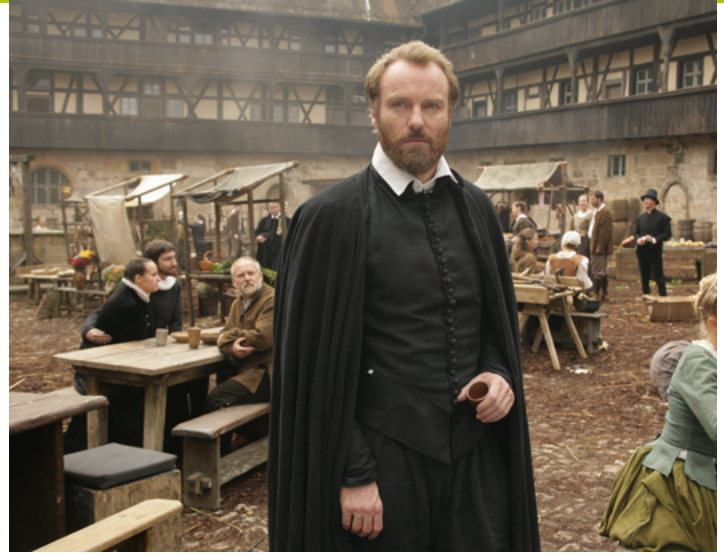
Die Seelen Im Feuer , 2014 – Production Company: Film Line Productions Filmproduktions GmbH (supported by the MEDIA TV Broadcasting scheme, 400.000 Euro)