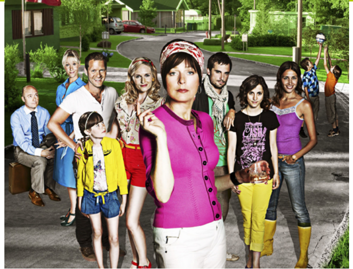
Lærkevej (Park Road), 2009. Production Company: Cosmo Film