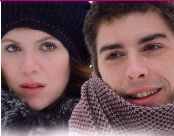
Dieci Inverni , 2009 – Production Company: Raicinema