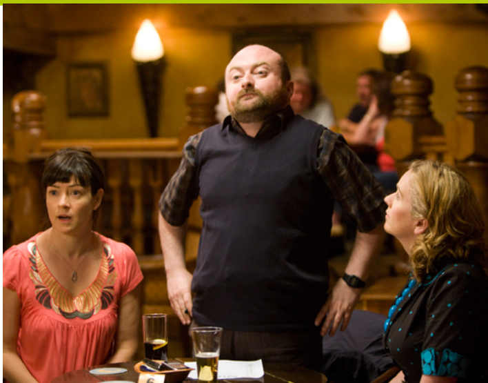
Trivia , 2010 – Production Company: Grand Pictures. Developed with the support of the MEDIA Slate Funding scheme.