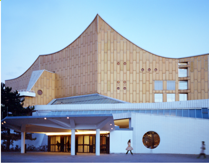
Cathedrals of Culture , 2013 - Production Company: Neue Road Movies GmbH (supported by the MEDIA TV Broadcasting scheme, 300.000 Euro)