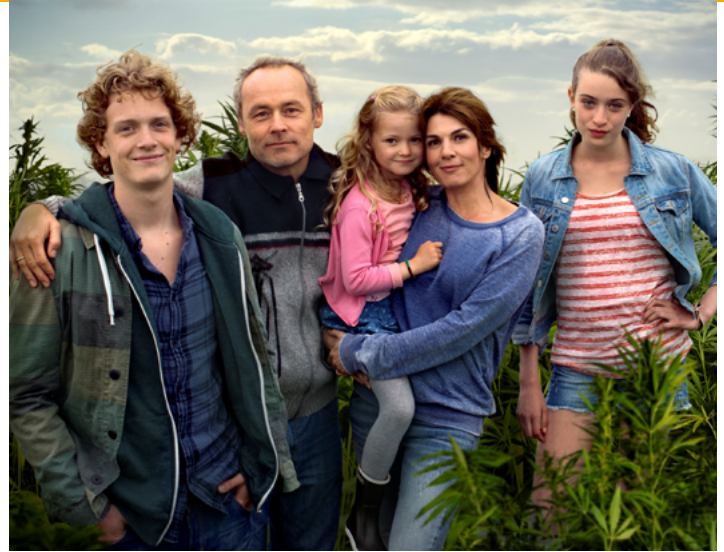
Hollands Hoop , directed by Dana Nechushtan, produced by Lemming Film, ARA, VPRO, NTR - 2014