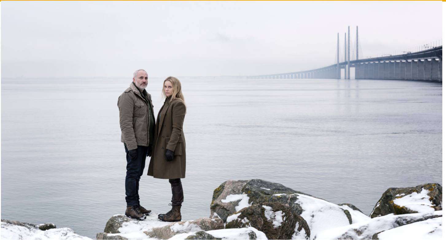
The Bridge - Season Two. Sofia Helin and Kim Bodnia as Saga and Martin.