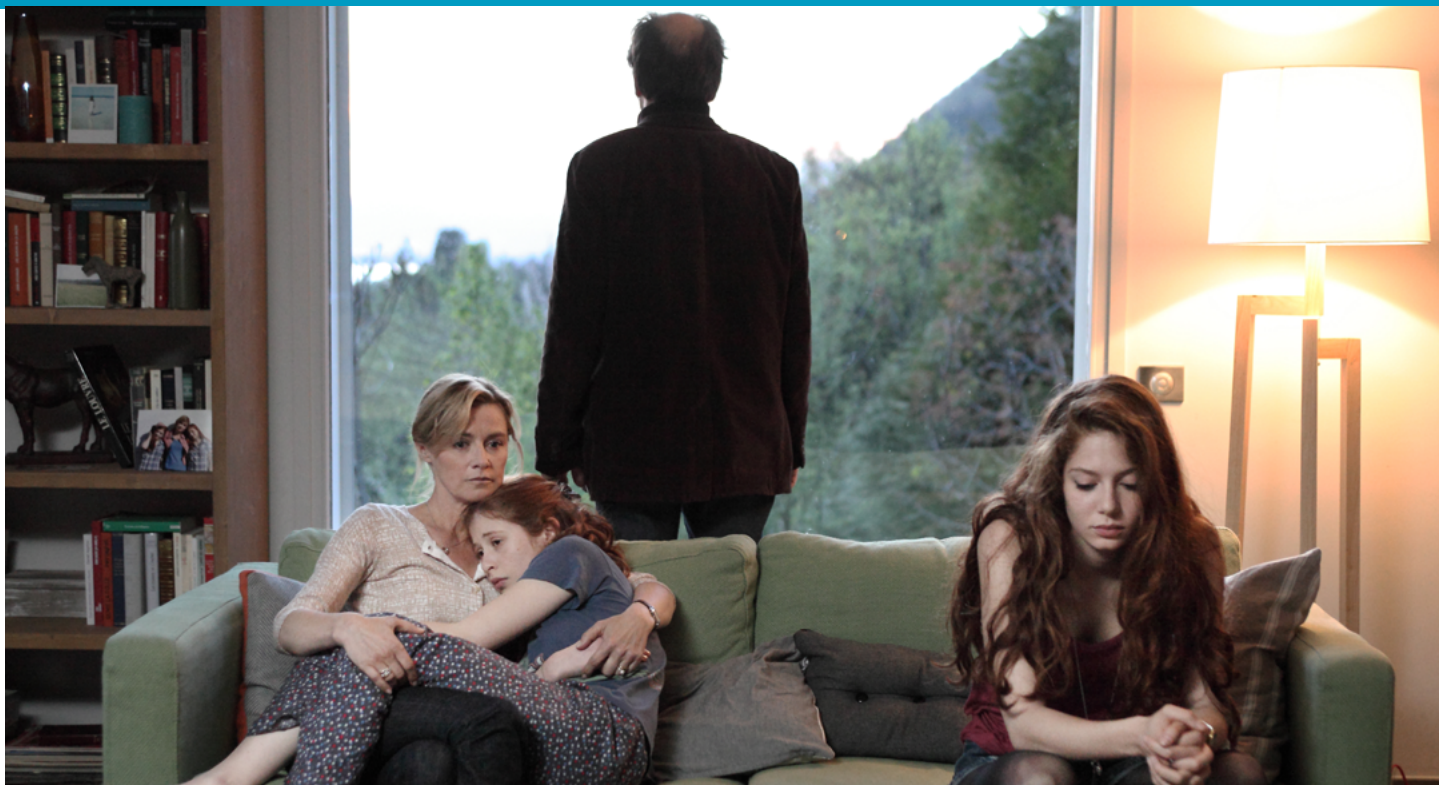
The Rebound (Les revenants) which receive MEDIA TV broadcasting support in 2012.