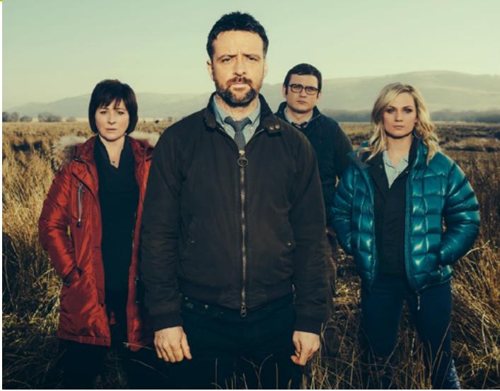
Hinterland , 2014 – Production company: Fiction Factory