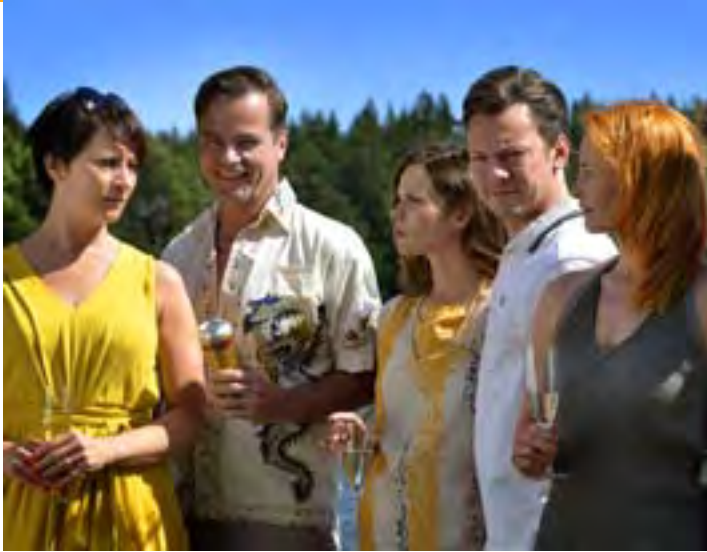
Mustat lesket (Black Widows) , © Moskito Television/Else Kyhä