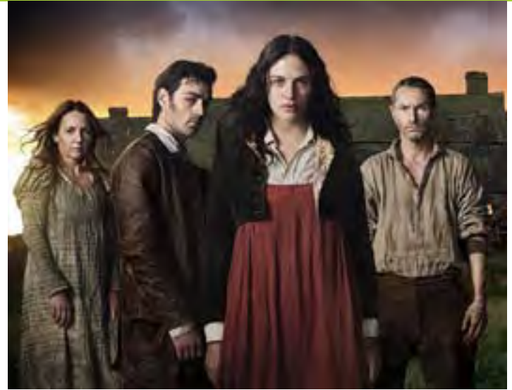
Jamaica Inn , 2014 – Production company: Origin Pictures