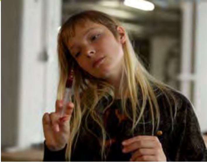
The Spiral . Produced by Caviar, Belgium. Developed with the support of the MEDIA Interactive support scheme.