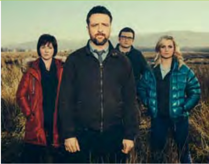
Hinterland , 2014 – Production company: Fiction Factory