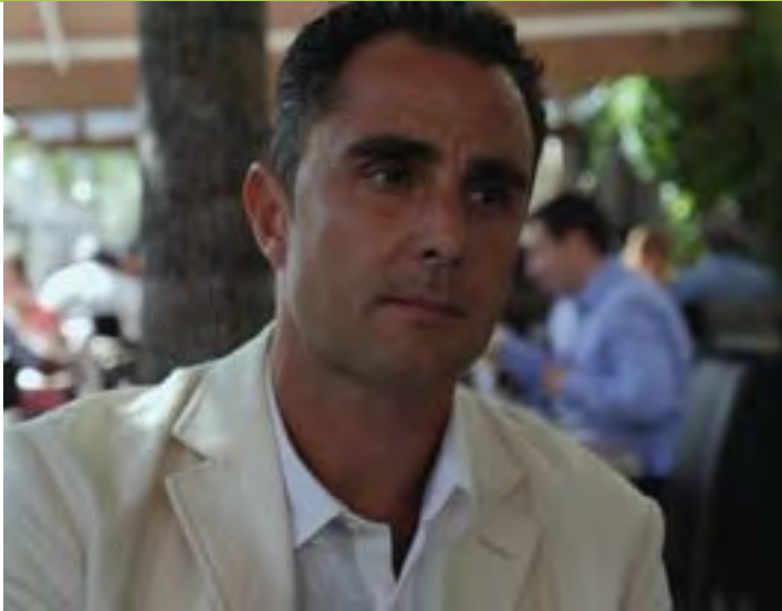
Falciani's Tax Bomb , 2014 – Production Company: gebrueder beetz filmproduktion (supported by the Creative Europe MEDIA TV Programming scheme, 120.000 Euro)