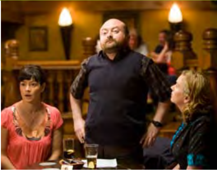
Trivia , 2010 – Production Company: Grand Pictures. Developed with the support of the MEDIA Slate Funding scheme.