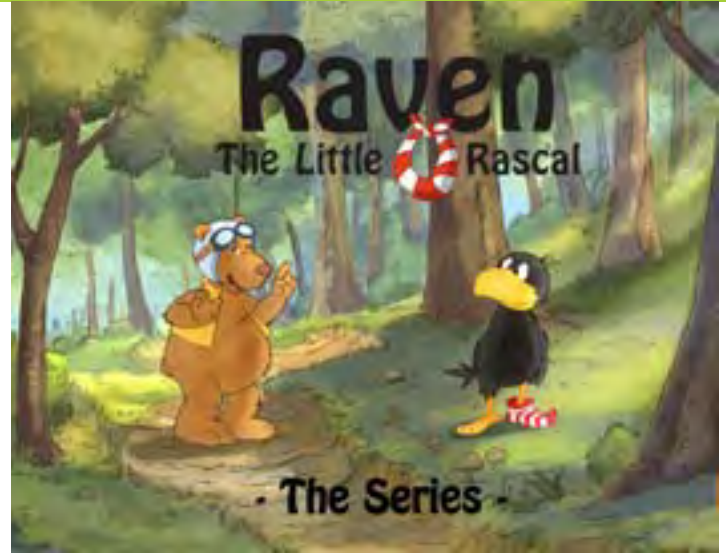
Raven, the Little Rascal – The Series , 2015 – Production Company: Akkord Film Produktion GmbH (supported by the Creative Europe MEDIA TV Programming scheme, 500.000 Euro)