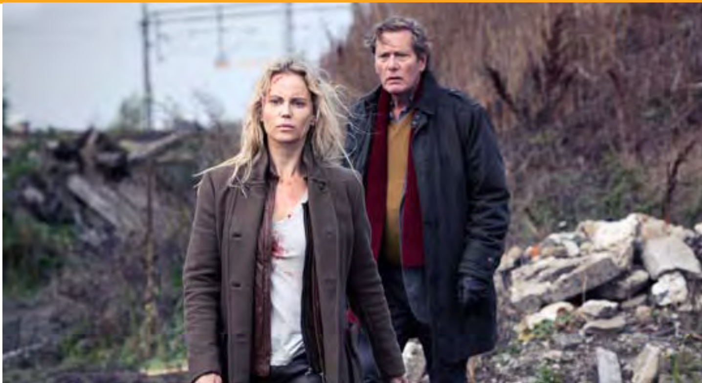
Sofia Helin and Dag Malmberg in The Bridge - Season Three which received TV Programming support from Creative Europe