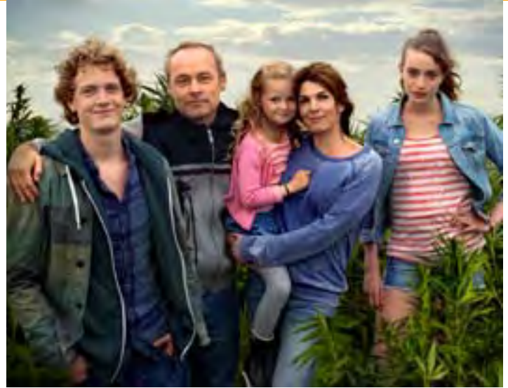
Hollands Hoop , directed by Dana Nechushtan, produced by Lemming Film, VARA, VPRO, NTR - 2014