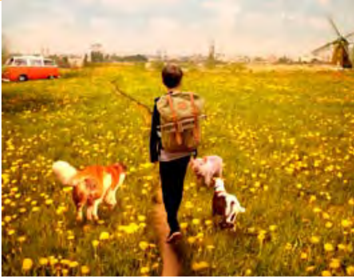
Alleen op de Wereld , produced by Lemming Film - 2015