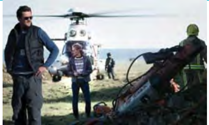
Both of these images are from The Cliff (Hamarinn) , 2009. Production Company: Pegasus.