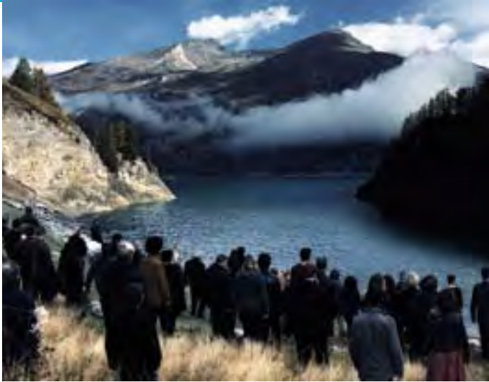
The Rebound 2 (Les revenants, saison 2) which receive MEDIA TV Programming support in 2014.