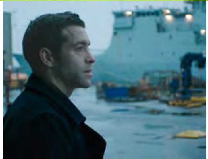
Norskov. Produced by SF FILM PRODUCTION for TV 2 Danmark A/S