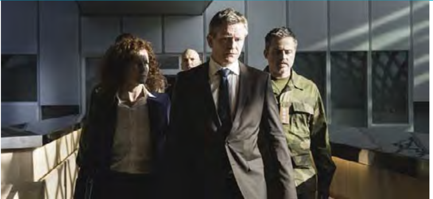
Occupied (Yellow Bird Norway AS) has received funding from the TV-programming scheme of the MEDIA programme.