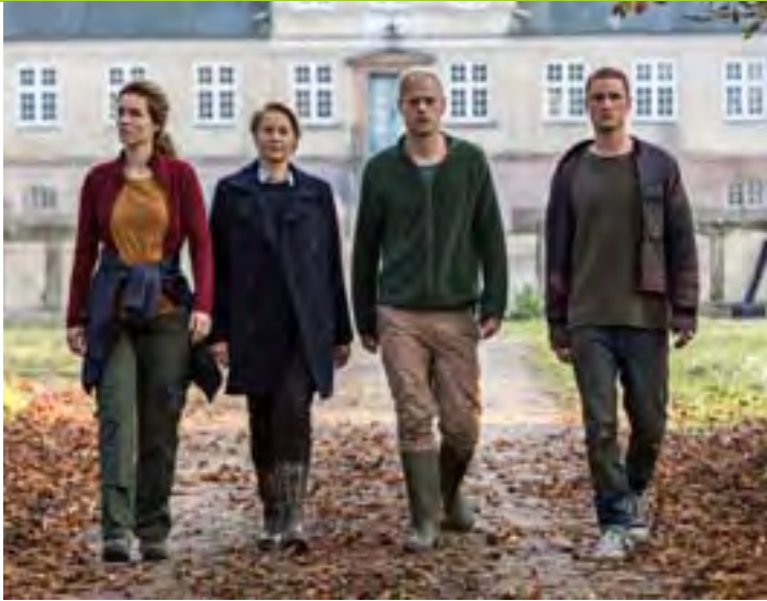
The Legacy II. Produced by DR Fiction