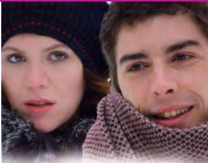
Dieci Inverni , 2009 – Production Company: Raicinema