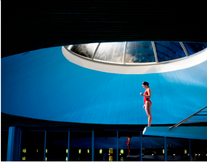
Jälkilämpö, (Latent Heat), 2009 – Production Company: Kinotar Oy