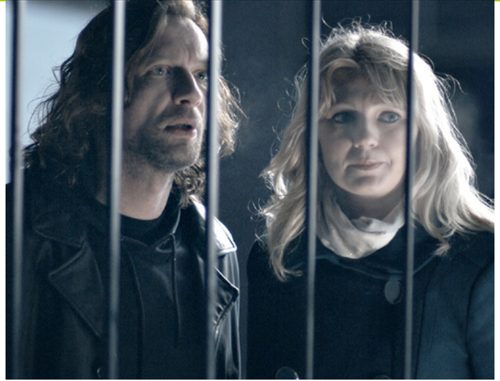
Alamaailma (Underworld Trilogy), 2011 – Production Company: Vertigo Oy