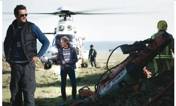
Both of these images are from The Cliff (Hamarinn) , 2009. Production Company: Pegasus.