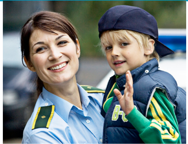
Anna Pihl , 2006. Production Company: Cosmo Film