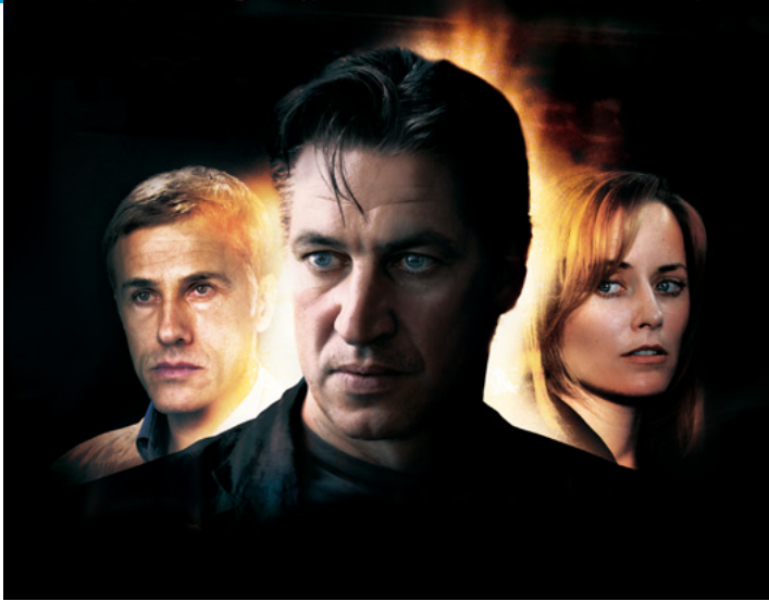
Das Jüngste Gericht, (The Last Judgement), 2007 – Production Company: Lisa Film