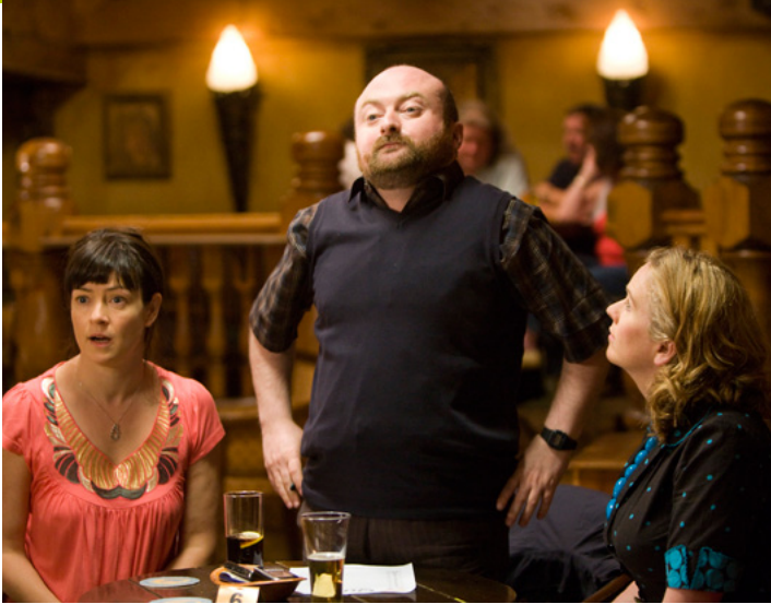
Trivia , 2010 – Production Company: Grand Pictures. Developed with the support of the MEDIA Slate Funding scheme.