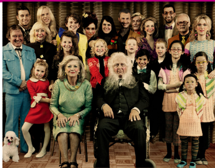
Het Gordijnpaleis van Ollie Hartmoed produced by Lemming Film co-produced by Willy Waltz (NL), A Private View (BE) and broadcaster VPRO, VRT. Developed with the support of the MEDIA Programme (Slate Funding). Released December 2011