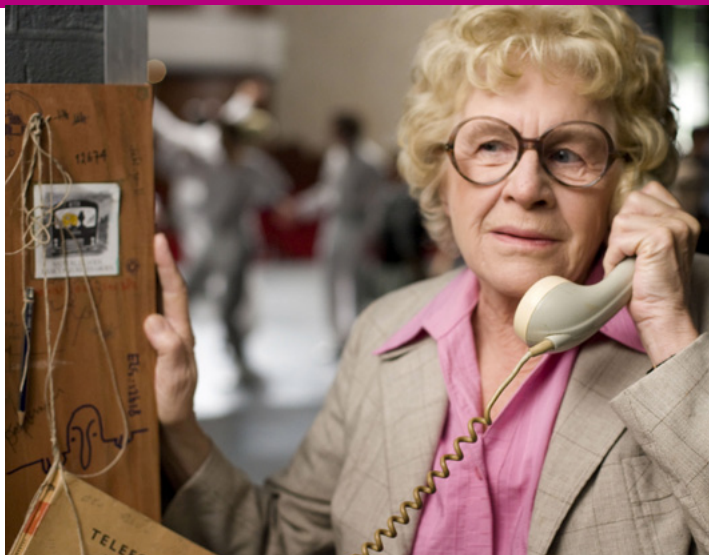
Annie MG , 2009 – Production Company: BosBros, with co-producers the broadcasters VRT, VARA & NPS