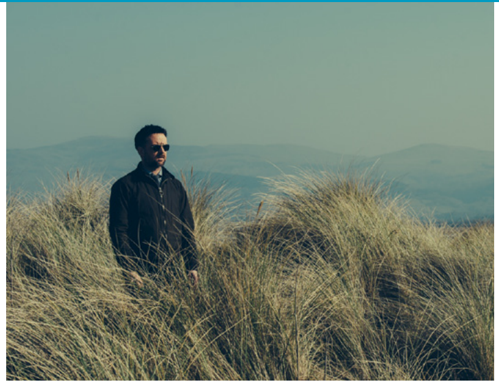
Hinterland , 2013 – Production company: Fiction Factory