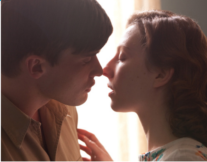
The Promise , 2011 – Production Company: Daybreak Pictures