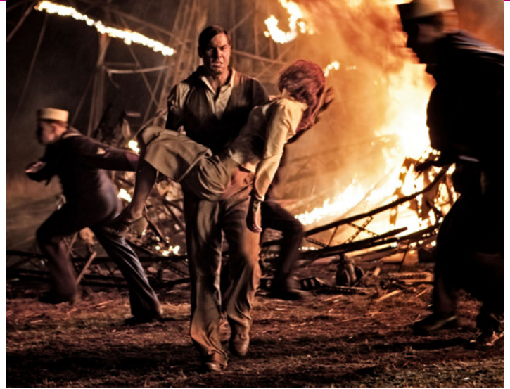
Hindenburg , a TV movie in two parts. Production company: teamWorx 2011 (supported by the MEDIA TV Broadcasting scheme).