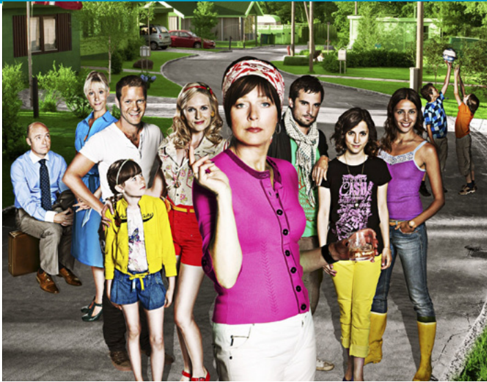
Lærkevej (Park Road) , 2009. Production Company: Cosmo Film