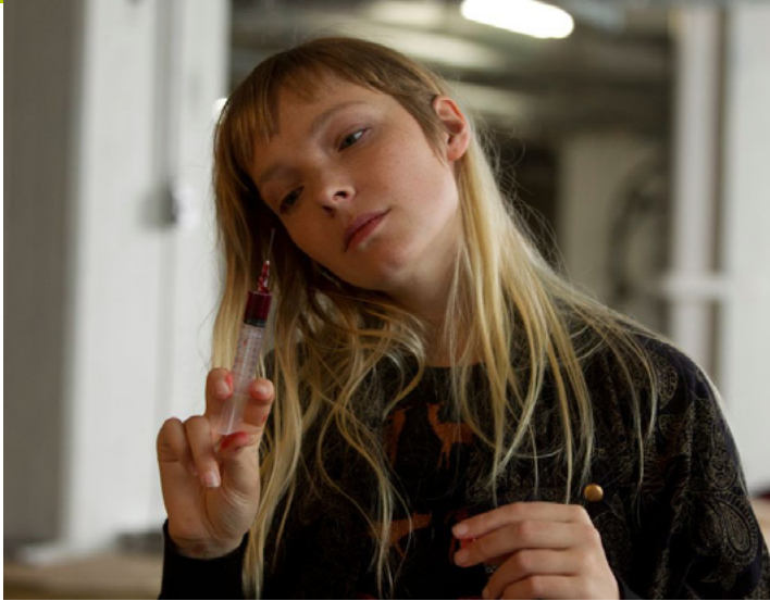
The Spiral . Produced by Caviar, Belgium. Developed with the support of the MEDIA Interactive support scheme.