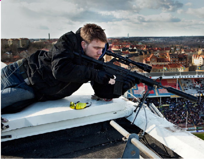
Drottningofret (The Sacrifice), 2010 – Production Company: Bob Film.