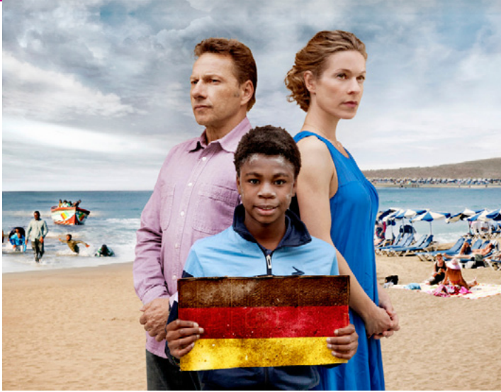
Welcome to the Club , 2013 - Production Company: Hager Moss Film (supported by the MEDIA TV Broadcasting scheme)