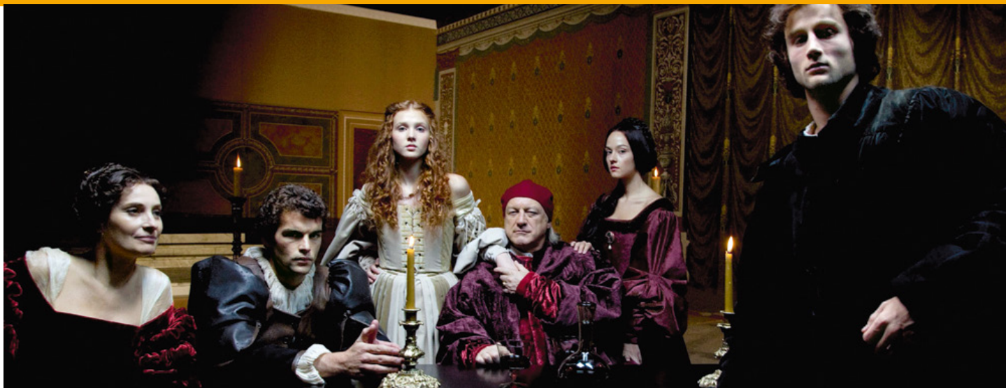
Borgia . Produced by Canal+, Atlantique and EOS with the support of the MEDIA TV Broadcasting scheme.