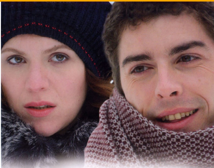
Dieci Inverni , 2009 – Production Company: Raicinema