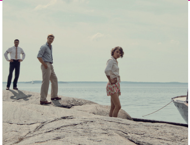
Death of a Loved One 2013 - Production Company: Pampas Produktion (supported by the MEDIA TV Broadcasting scheme).